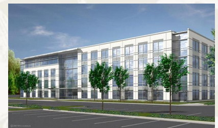
Riverside Five Rendering courtesy of Matan Companies

Ground recently broke on a 126,000 SF office building for Riverside Five in Frederick. This class A building, part of the Riverside Corporate Park and next to a proposed 15-acre retail development, is scheduled to deliver in the spring. Developed by Matan Companies, Riverside Five is also next to Matan's Riverside Research Park which is set to deliver the first building this spring.