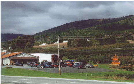
Catoctin Mountain Orchard, Thurmont, Maryland

The town of Thurmont is one of Frederick County's most dynamic municipalities, home to over 430 businesses which occupy more than 530,000 square feet of commercial space. Thurmont has the distinct designation of being one of only a handful of "Main Street Maryland" communities. Also known as the "Gateway to the Mountains," Thurmont offers residents and businesses opportunities to flourish in its beautiful surroundings.